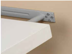
Hidden Bracket System

The squared ends of this 1 3/4" thick shelf add to its solid appearance. The easy to install hidden bracket system makes the shelf flush with the wall. Whether in the natural wood finish, or in one of the more contemporary colors, the Grande offers a confident and substantial presence.