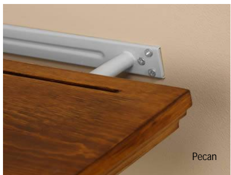
Hidden Bracket System

With their classic decorative edges, these solid wood shelves give accent in any room, particularly in more traditional settings. Provides a great compliment to rooms with crown and cove moldings. This shelf brings design and function together. The hidden bracketing system makes the shelf flush with the wall. Bracket system included.